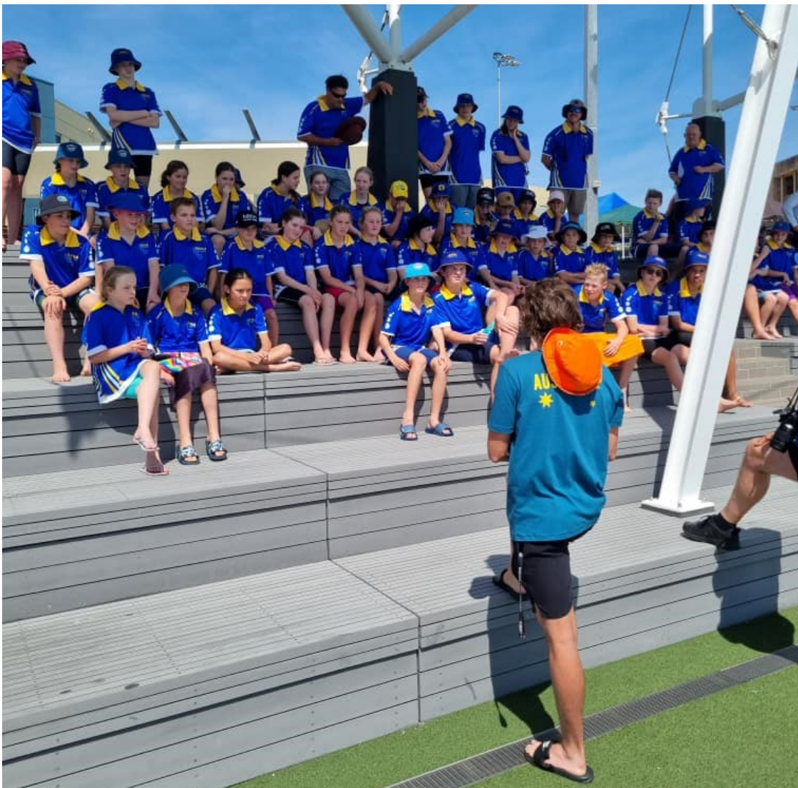
2022 Patrons Shield Team hosted by Swimming Gold Coast at the Bond University Aquatic Centre