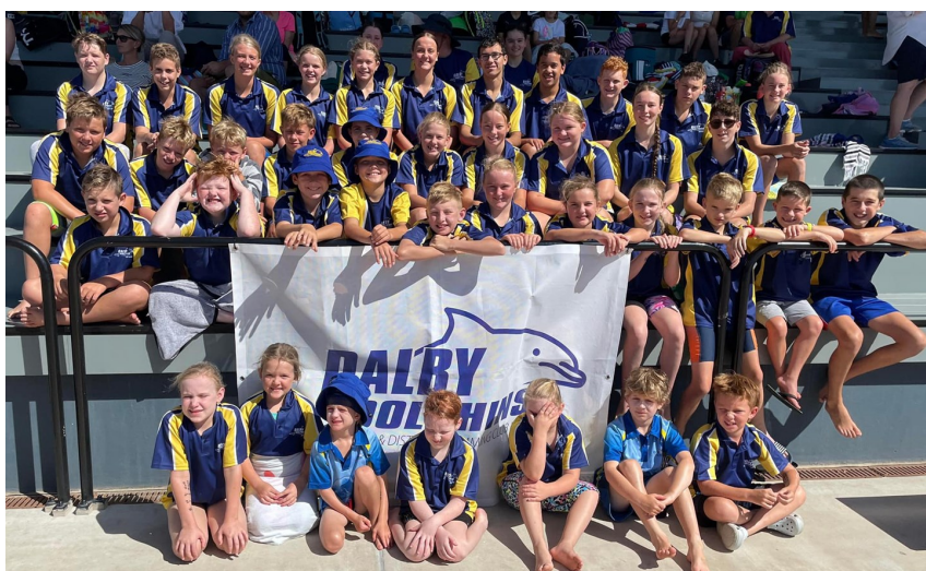
2023 COUNTRY CHAMPIONSHIPS HOSTS - DALBY SC