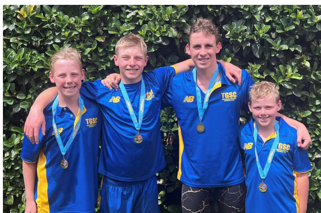
DAVID BROADFOOT MEMORIAL TROPHY