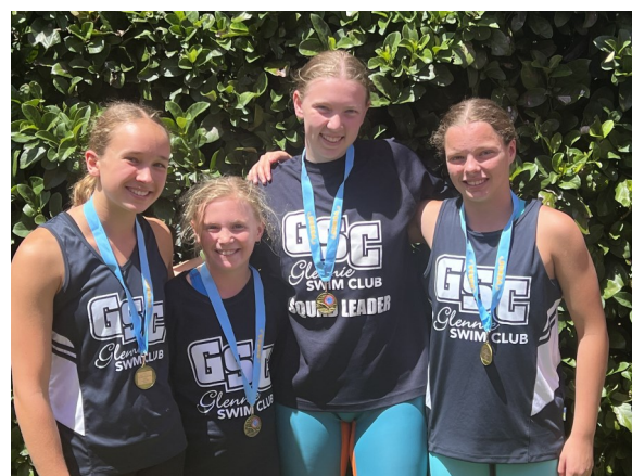
MERV LANCASTER MEMORIAL TROPHY