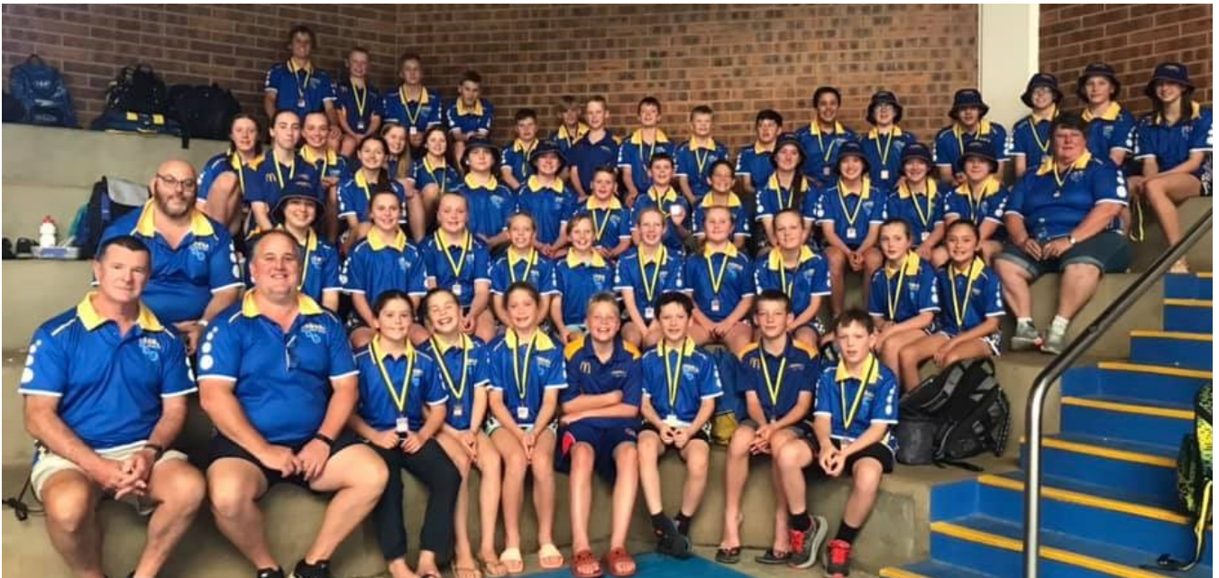
2021 Patrons Shield Team, hosted by The Glennie Swim Club, Toowoomba