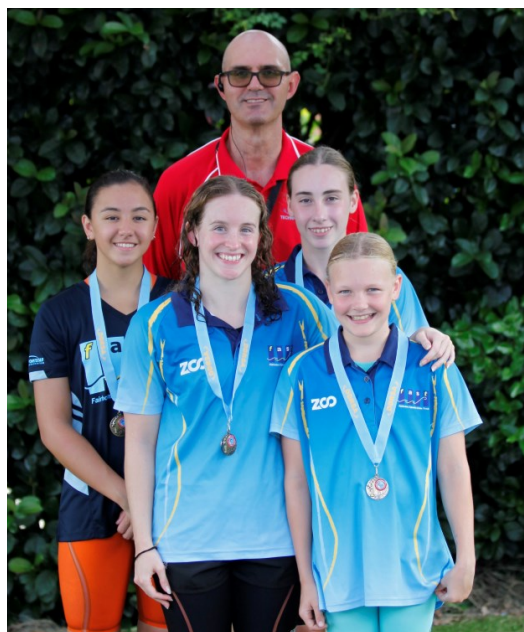
MERV LANCASTER MEMORIAL TROPHY