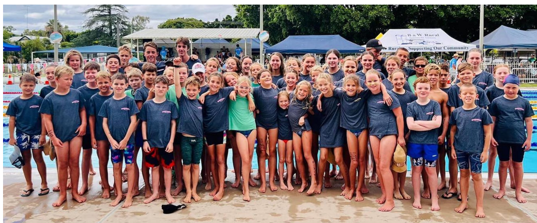
2022 COUNTRY CHAMPIONSHIPS HOSTS - GOONDIWINDI SC