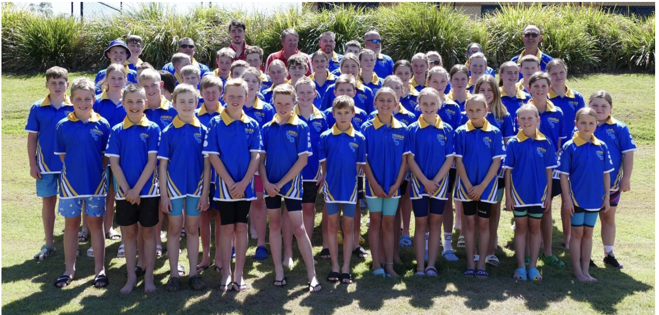
2023 Patrons Shield Team hosted by Swimming Wide Bay at the Mountain Creek Aquatic Centre Aquatic Centre