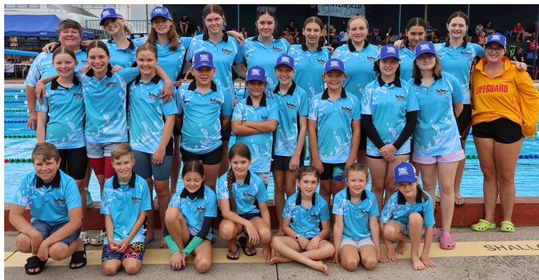
2024 COUNTRY CHAMPIONSHIPS HOSTS - STANTHORPE AS&LSC