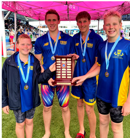
DAVID BROADFOOT MEMORIAL TROPHY