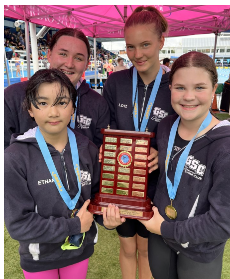
MERV LANCASTER MEMORIAL TROPHY