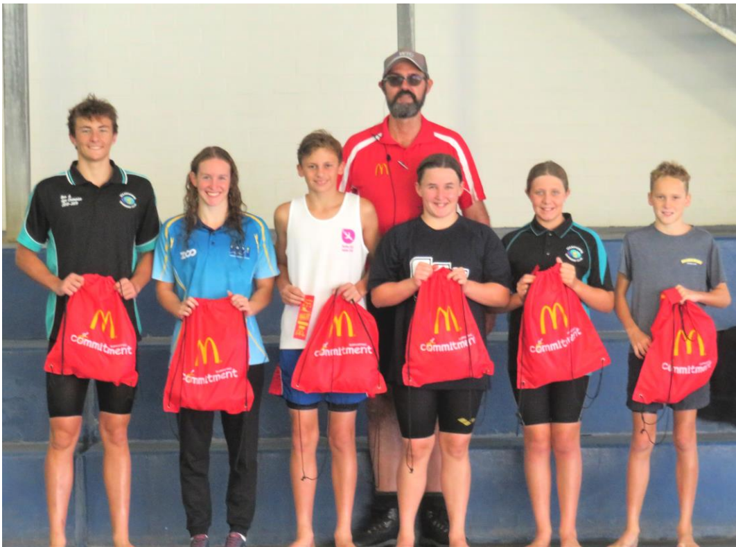
2020 DDRSA LC Sprint Champions